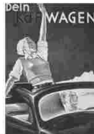
Fig. 10 – The poster announces: 'Your Volkswagen'. Such posters suggested that owning a car was no longer just a dream for an ordinary worker.

Hitler did not stop here. Schacht had advised Hitler against investing hugely in rearmament as the state still ran on deficit financing. Cautious people, however, had no place in Nazi Germany. Schacht had to leave. Hitler chose war as the way out of the approaching