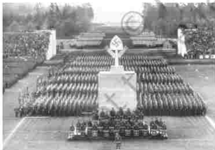
Fig. 9 – Hitler addressing SA and SS columns. Notice the sweeping and straight columns of people. Such photographs were intended to show the grandeur and power of the Nazi movement.

Hitler devised a new style of politics. He understood the significance of rituals and spectacle in mass mobilisation. Nazis held massive rallies