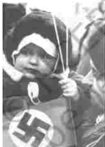
Fig. 26 – A German-blooded infant with his mother being brought from occupied Europe to Annexed Poland for settlement