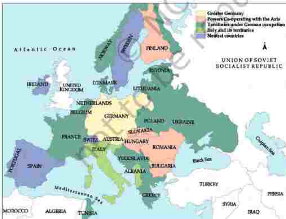
Fig. 11 – Expansion of Nazi power: Europe 1942.