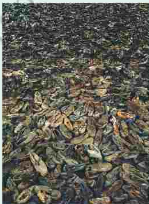
Fig. 22 – Shoes taken away from prisoners before the 'Final Solution'.