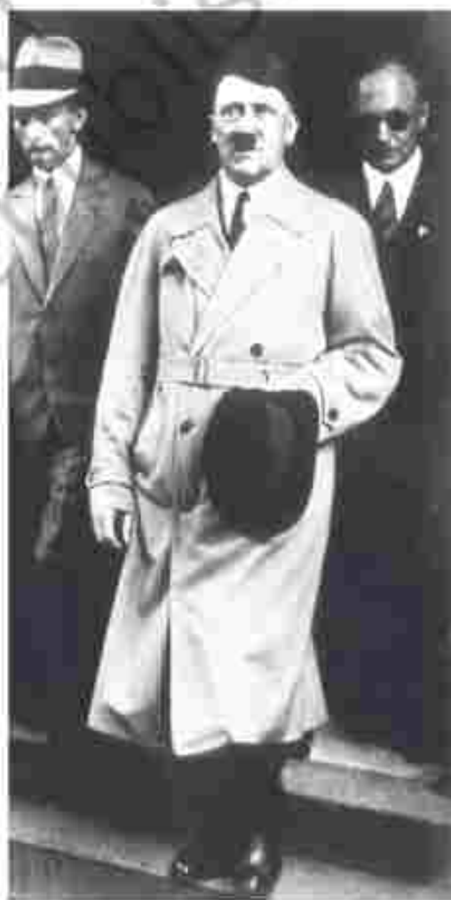
Fig. 1 – Hitler (centre) and Goebbels (left) leaving after an official meeting, 1932.

In May 1945, Germany surrendered to the Allies. Anticipating what was coming, Hitler, his propaganda minister Goebbels and his entire family committed suicide collectively in his Berlin bunker in April. At the end of the war, an International Military Tribunal at Nuremberg was set up to prosecute Nazi war criminals for Crimes against Peace, for War Crimes and Crimes Against Humanity. Germany's conduct during the war, especially those actions which