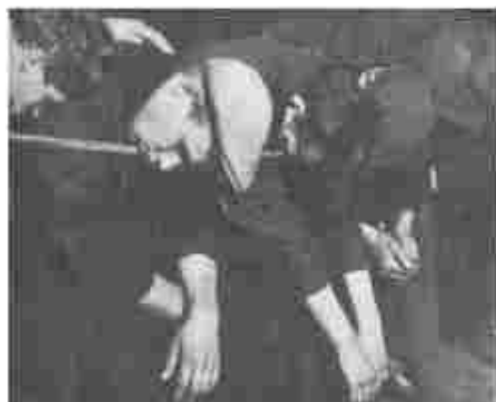
Fig. 6 – Sleeping on the line. During the Great Depression the unemployed could not hope for either wage or shelter. On winter nights when they wanted a shelter over their head, they had to pay to sleep like this.