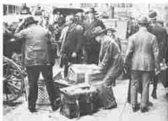
Fig. 4 – Baskets and carts being loaded at a bank in Berlin with paper currency for wage payment, 1923. The German mark had so little value that vast amounts had to be used even for small payments.