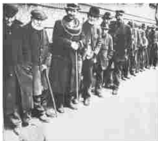
Fig. 5 – Homeless men queuing up for a night's shelter, 1929.

The economic crisis created deep anxieties and fears in people. The middle classes, especially salaried employees and pensioners, saw their savings diminish when the currency lost its value. Small businessmen, the self-employed and retailers suffered as their