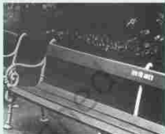
Fig. 16 – Anti-Jewish sign: 'FOR ARYANS ONLY'