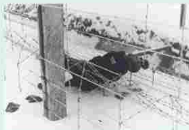
Fig. 18 – Killed while trying to escape. The concentration camps were enclosed with live wires.