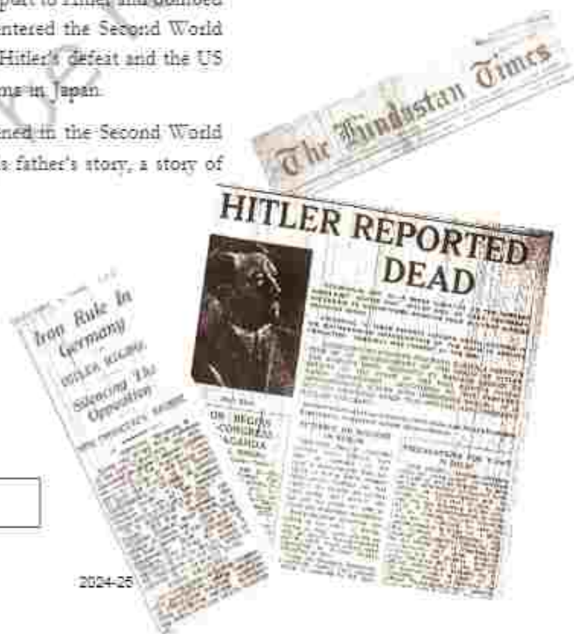
Fig. 12 – Newspapers in India track the developments in Germany.