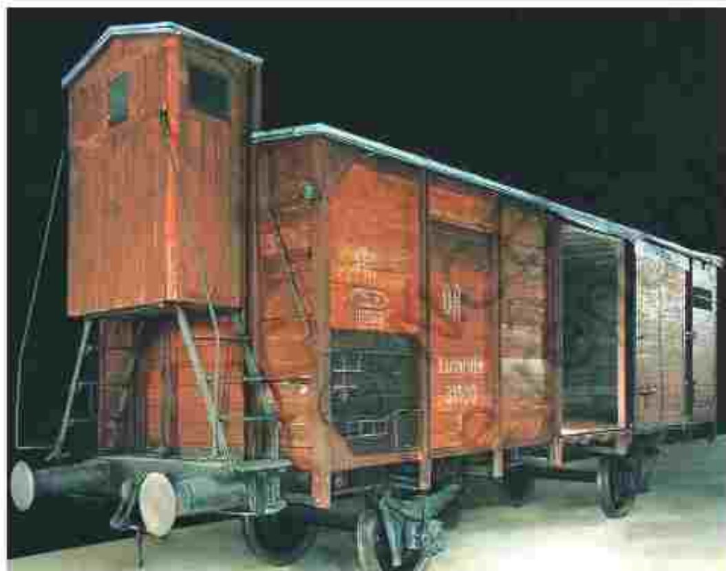
Fig. 14 – This is one of the freight cars used to deport Jews to the death chambers.