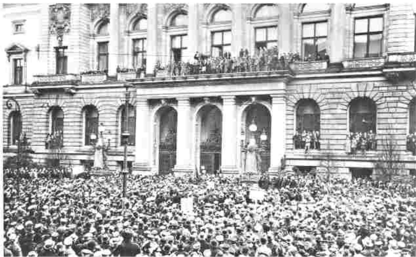
Fig. 3 – This is a rally organised by the radical group known as the Spartacist League. In the winter of 1918-1919 the streets of Berlin were taken over by the people. Political demonstrations became common.

in many cities. The political atmosphere in Berlin was charged with demands for Soviet-style governance. Those opposed to this – such as the socialists, Democrats and Catholics – met in Weimar to give shape to the democratic republic. The Weimar Republic crushed the uprising with the help of a war veterans organisation called Free Corps. The anguished Spartacists later founded the Communist Party of Germany. Communists and Socialists henceforth became irreconcilable enemies and could not make common cause against Hitler. Both revolutionaries and militant nationalists craved for radical solutions.