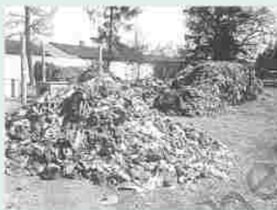
Fig. 19 – Pile of clothes outside the gas chamber

Jews from Jewish houses, concentration camps and ghettos from different parts of Europe were brought to death factories by goods trains. In Poland and elsewhere in the east, most notably Bełżec, Auschwitz, Sobibor, Treblinka, Chełmno and Majdanek, they were charred in gas chambers. Mass killings took place within minutes with scientific precision.