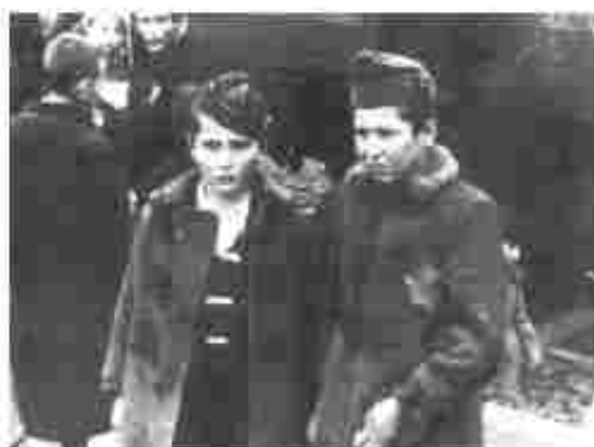
Fig. 27 – Jewish children arriving at a death factory to be gassed

'We start when the child is three years old. As soon as he even starts to think, he is given a little flag to wave. Then comes school, the Hitler Youth, military service. But when all this is over, we don't let go of anyone. The labour front takes hold of them, and keeps hold until they go to the grave, whether they like it or not.'