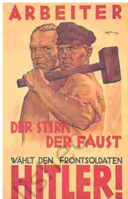
Fig. 30 – A Nazi party poster of the 1920s. It asks workers to vote for Hitler, the frontline soldier.