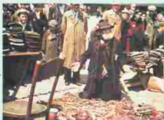
Fig. 17 – 'This is all I have to sell'. Men and women were left with nothing to survive in the ghettos.

Synagogues – Place of worship for people of Jewish faith.