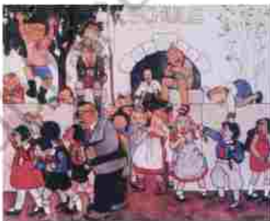
Fig.24 – Jewish teacher and Jewish pupils expelled from school under the jeers of classmates. From Träu keinem Jud auf grüner Heide: Ein Bilderbuch für Gross und Klein (Trust No Jew on the Green Heath: a Picture Book for Big and Little). By Eivore Bauer (Nuremberg: Der Sturmer , 1936).