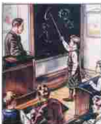
Fig.23 – Classroom scene depicting a lesson on racial anti-Semitism. From Der Giftpilz (The Poison Mushroom) by Ernst Hiemer (Nuremberg: der Sturmer , 1938), p.7. Caption reads: 'The Jewish nose is bent at its point. It looks like the number six.'

Jungvolk – Nazi youth groups for children below 14 years of age.