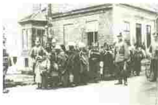
Fig. 13 - Police escorting gypsies who are being deported to Auschwitz, 1943-1944.

Under the shadow of war, the Nazis proceeded to realise their murderous, racial ideal. Genocide and war became two sides of the same coin. Occupied Poland was divided up. Much of north-western Poland was annexed to Germany. Poles were forced to leave their homes and properties behind to be occupied by ethnic Germans brought in from occupied Europe. Poles were then herded like