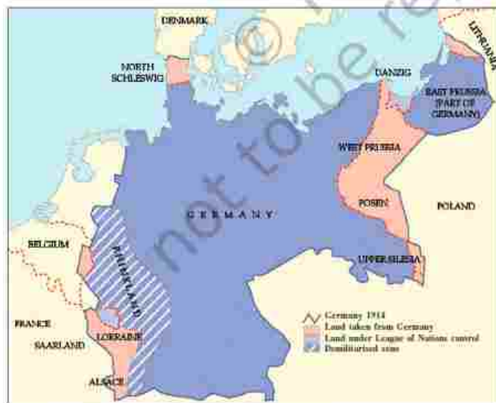
Fig.2 – Germany after the Versailles Treaty. You can see in this map the parts of the territory that Germany lost after the treaty.

This republic, however, was not received well by its own people largely because of the terms it was forced to accept after Germany's defeat at the end of the First World War. The peace treaty at