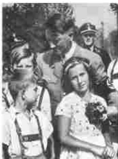
Fig. 25 – 'Desirable' children that Hitler wanted to see multiplied