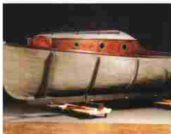
Fig. 32 – Denmark secretly rescued their Jews from Germany. This is one of the boats used for the purpose.