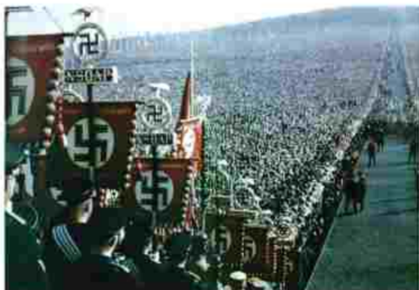
Fig. 8 – Nuremberg Rally, 1936: Rallies like this were held every year. An important aspect of these was the demonstration of Nazi power as various organisations paraded past Hitler, swore loyalty and listened to his speeches.

Hitler was a powerful speaker. His passion and his words moved people. He promised to build a strong nation, undo the injustice of the Versailles Treaty and restore the dignity of the German people. He promised employment for those looking for work, and a secure future for the youth. He promised to weed out all foreign influences and resist all foreign 'conspiracies' against Germany.