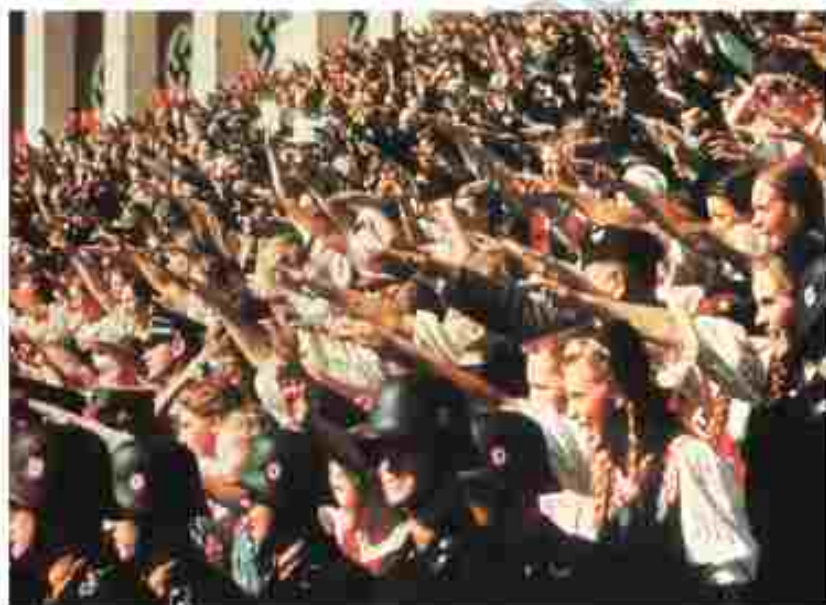
Fig. 7 – Hitler being greeted at the Party Congress in Nuremberg in 1938.

In 1923, Hitler planned to seize control of Bavaria, march to Berlin and capture power. He failed, was arrested, tried for treason, and later released. The Nazis could not effectively mobilise popular support till the early 1930s. It was during the Great Depression that Nazism became a mass movement. As we have seen, after 1929, banks collapsed and businesses shut down, workers lost their jobs and the middle classes were threatened with destitution. In such a situation Nazi propaganda stirred hopes of a better future. In 1926, the Nazi Party got no more than 2.6 per cent votes in the Reichstag — the German parliament. By 1932, it had become the largest party with 37 per cent votes.