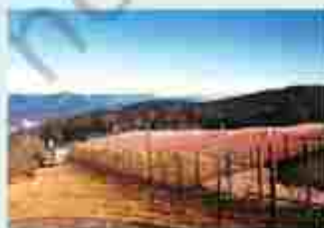
Fig. 21 – A concentration camp. A camera can make a death camp look beautiful.