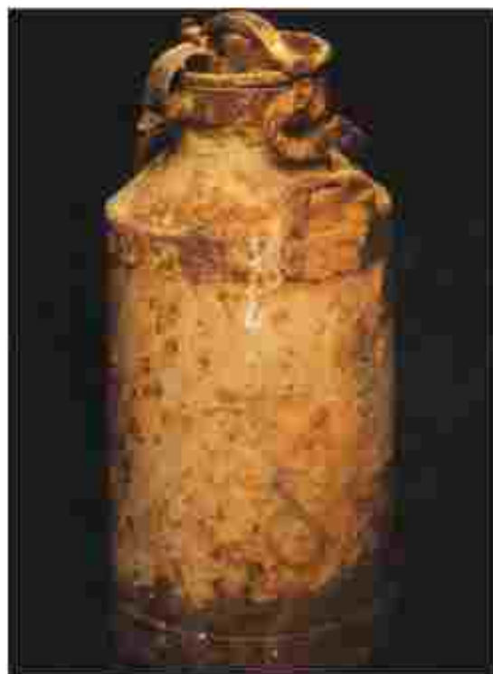
Fig. 31 – Inhabitants of the Warsaw ghetto collected documents and placed them in three milk cans along with other containers. As destruction seemed imminent, these containers were buried in the cellars of buildings in 1943. This can was discovered in 1950.

Yet the history and the memory of the Holocaust live on in memoirs, fiction, documentaries, poetry, memorials and museums in many parts of the world today. These are a tribute to those who resisted it, an embarrassing reminder to those who collaborated, and a warning to those who watched in silence.