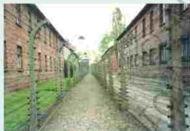
Fig. 20 – A Concentration Camp

Jews from Jewish houses, concentration camps and ghettos from different parts of Europe were brought to death factories by goods trains. In Poland and elsewhere in the east, most notably Bełżec, Auschwitz, Sobibor, Treblinka, Chełmno and Majdanek, they were charred in gas chambers. Mass killings took place within minutes with scientific precision.